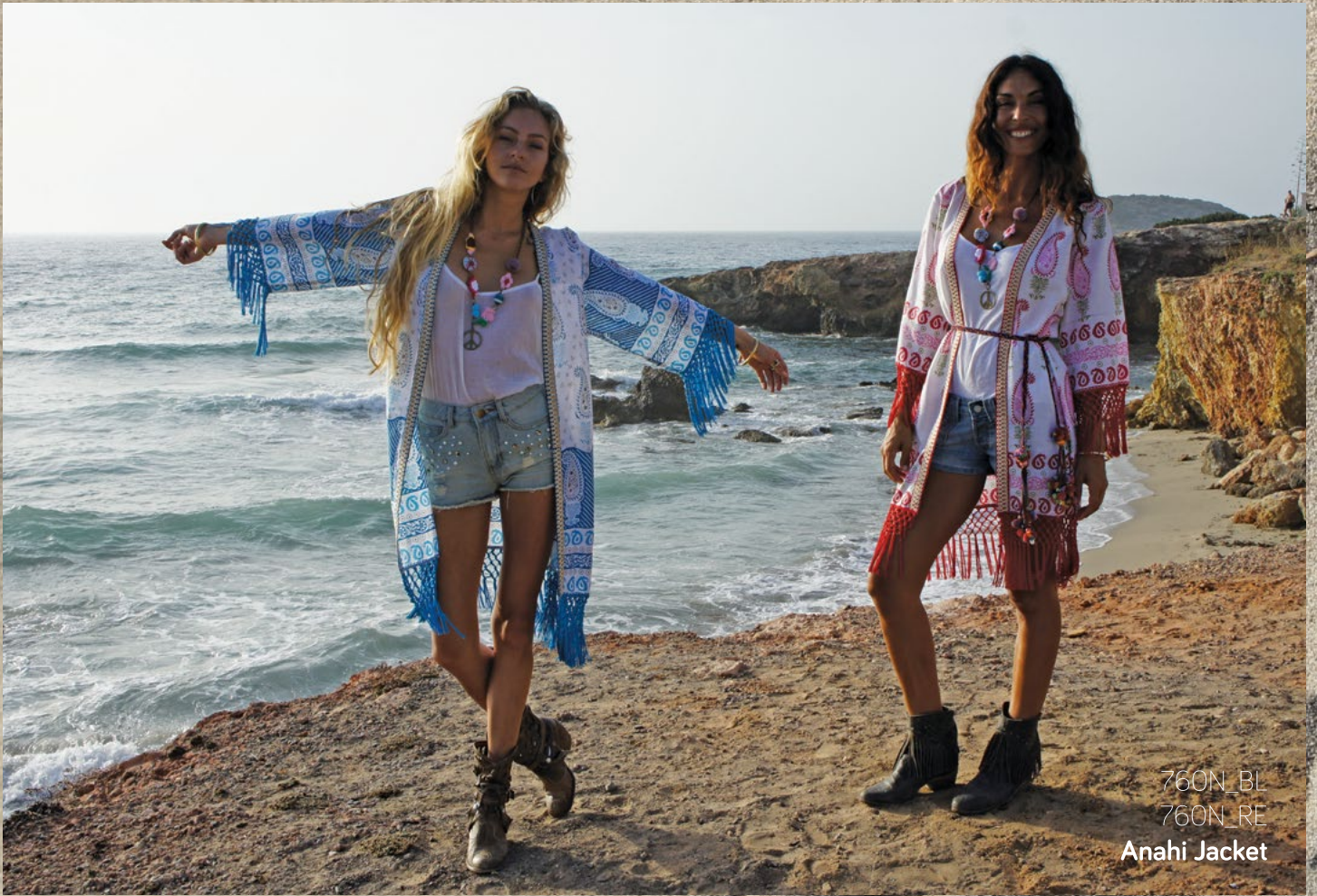
760N_BL 760N_RE Anahi Jacket